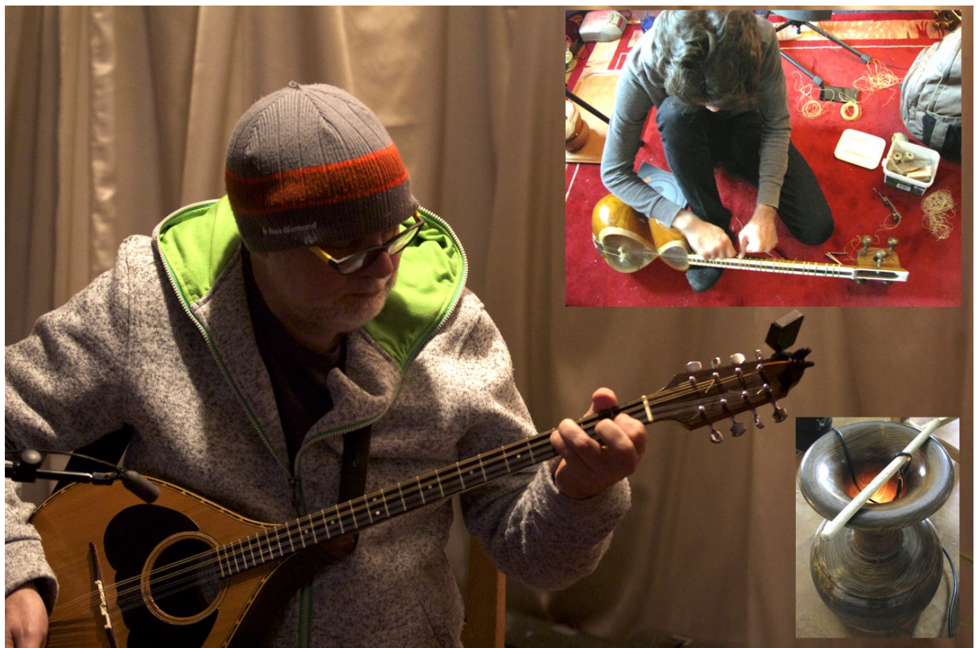
Tuning the Irish bouzouki, fretting the Persian long-necked lute tar, and warming the skin of the Persian goblet drum tombak.