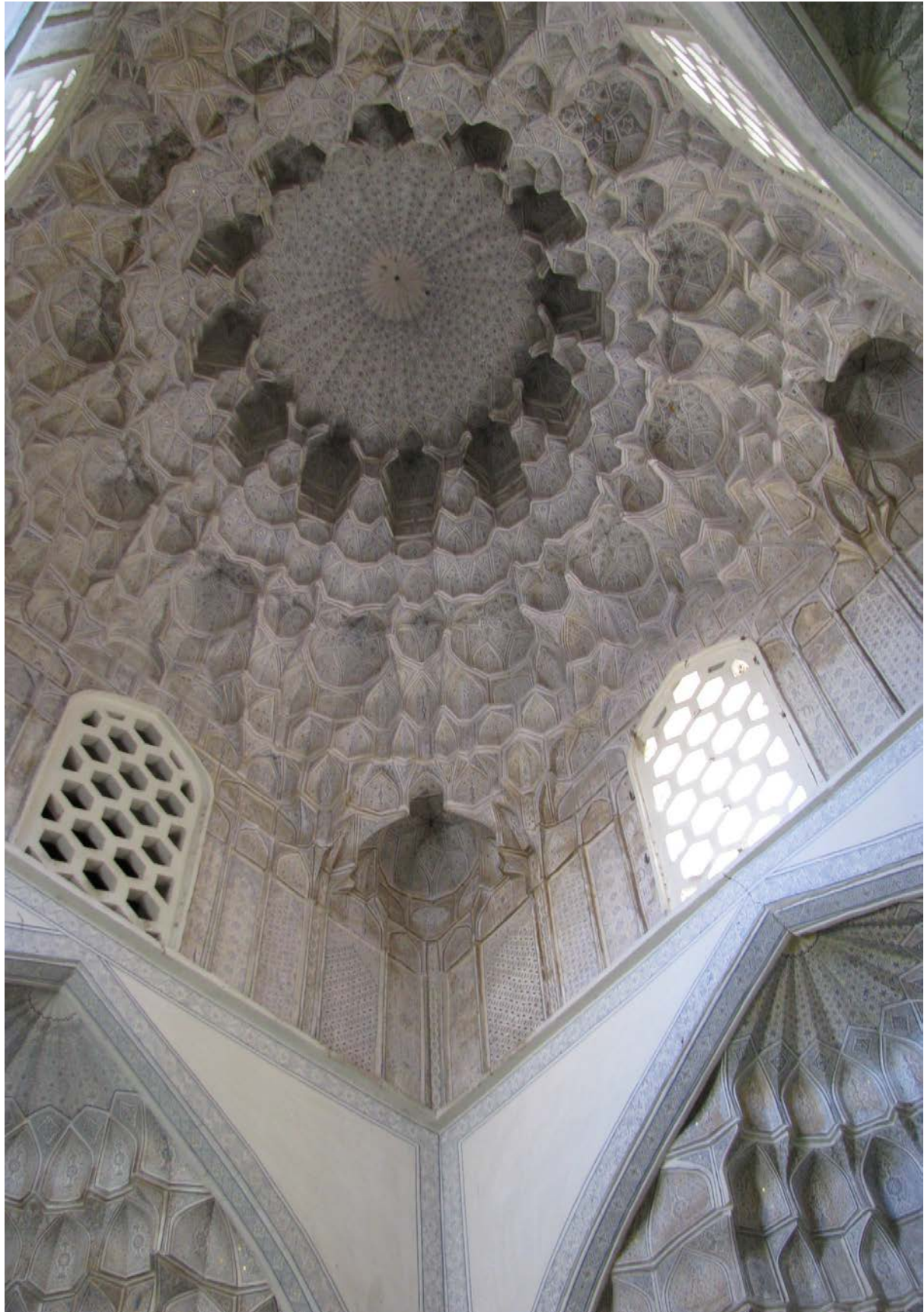
Fig. 3: On the northern outskirts of Samarkand there is a complex of mausoleums called Shakhi Zinda, which is Persian for 'The Living King'. Detail of this memorial complex of Islamic architecture.